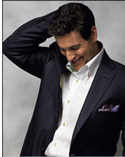
The Gentleman with an open collared sport shirt