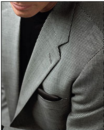
The Mover and Shaker with a mock turtleneck

These are but a few ways to use the venerable sportcoat to achieve different effects this fall.