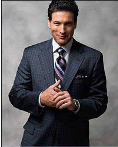
The Ultimate Professional with a dress shirt and tie

Our favorite ways to gear up and wear a sportcoat in fall and winter