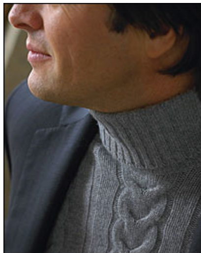
The Risk Taker with a cable knit turtleneck