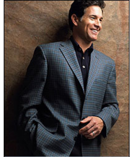
The Man About Town with a three button polo knit